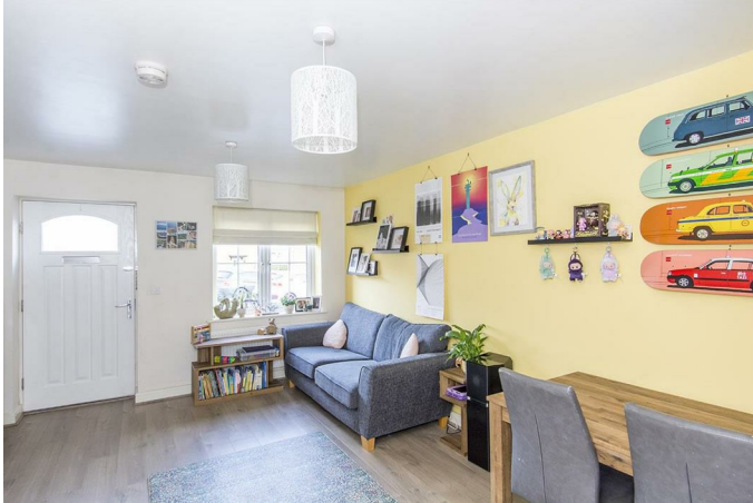
Lounge/Diner 15'6" x 12'5" (4.72m x 3.78m)

Composite double-glazed front entrance door. UPVC double-glazed window to front. Range of fitted understorage cupboards with solid oak tops. Two radiators.