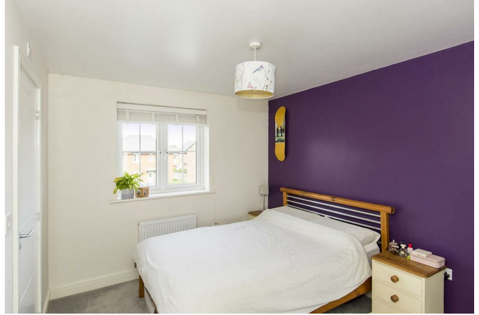
UPVC double-glazed window to front. Airing cupboard. Radiator.