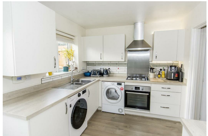
Breakfast Kitchen 12'5" x 8'5" (3.78m x 2.57m)

Composite double-glazed rear entrance door. UPVC double-glazed window to rear. Fitted range of floor and wall mounted units with lighting under. Stainless steel one and a half bowl sink. Built in electric oven. Gas hob with extractor hood over. Space and plumbing for washing machine. Space for fridge/freezer and dryer. Laminate flooring. Radiator.