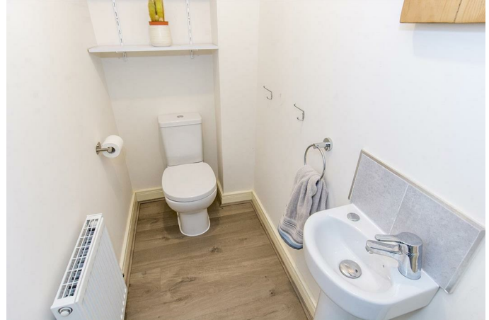
Ground Floor WC 6'0" x 3'3" (1.83m x 0.99m)

Ground floor wc. Wash hand basin. Extractor fan. Radiator.